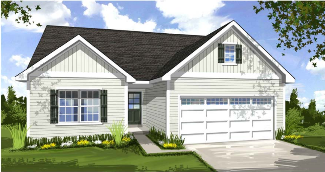
COTTAGE ELEVATION B