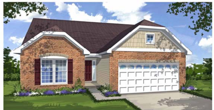
OLD WORLD ELEVATION C