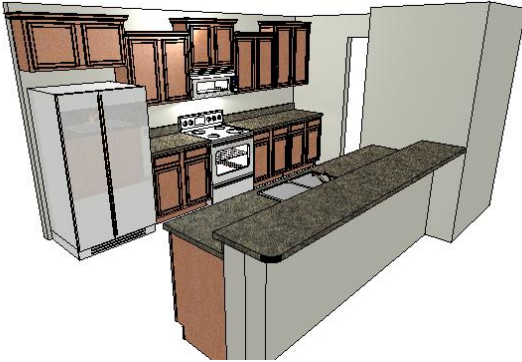
KITCHEN (SHOWN WITH STANDARD KITCHEN LAYOUT)