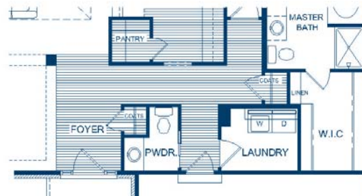
OPTIONAL POWDER ROOM