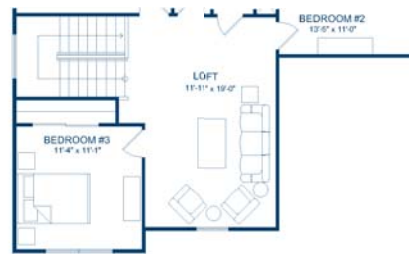
OPTIONAL LOFT ILO BED#3