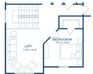
OPTIONAL LOFT ILO BED#4