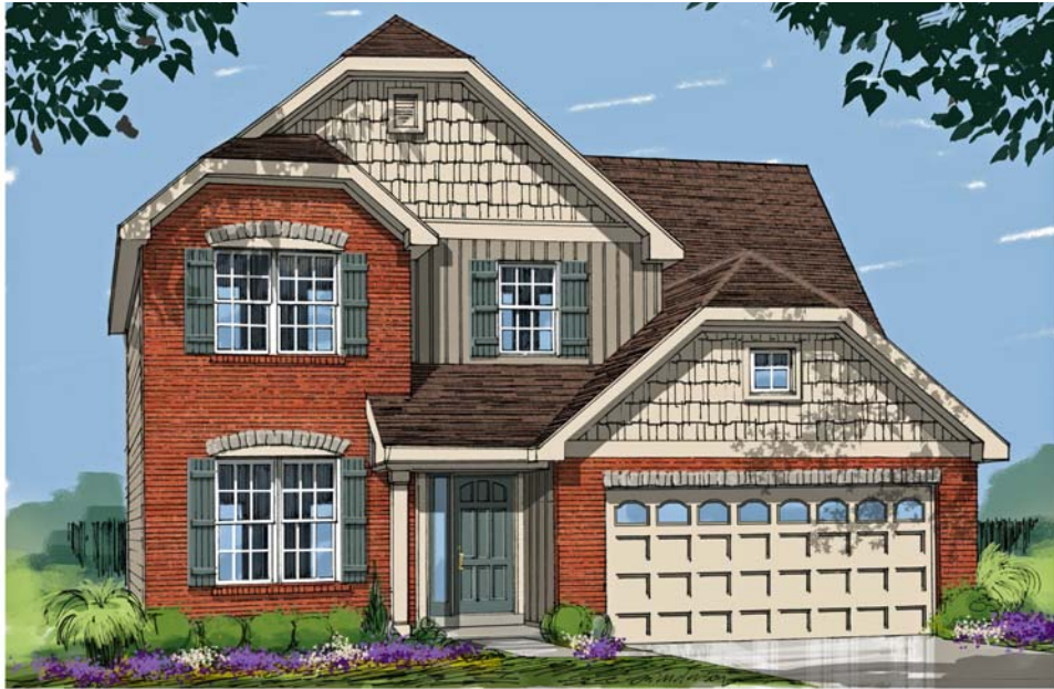
OLD WORLD ELEVATION C