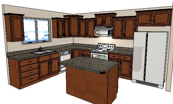
KITCHEN (SHOWN WITH OPTIONAL STAGGERED WALL CABINETS & ISLAND)