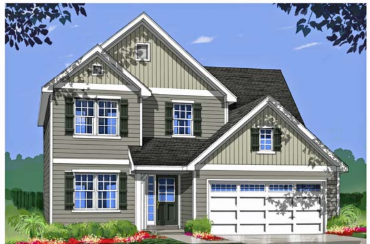
COTTAGE ELEVATION B