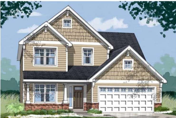
CRAFTSMAN ELEVATION D