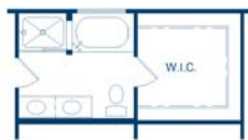
LUXURY MASTER BATH