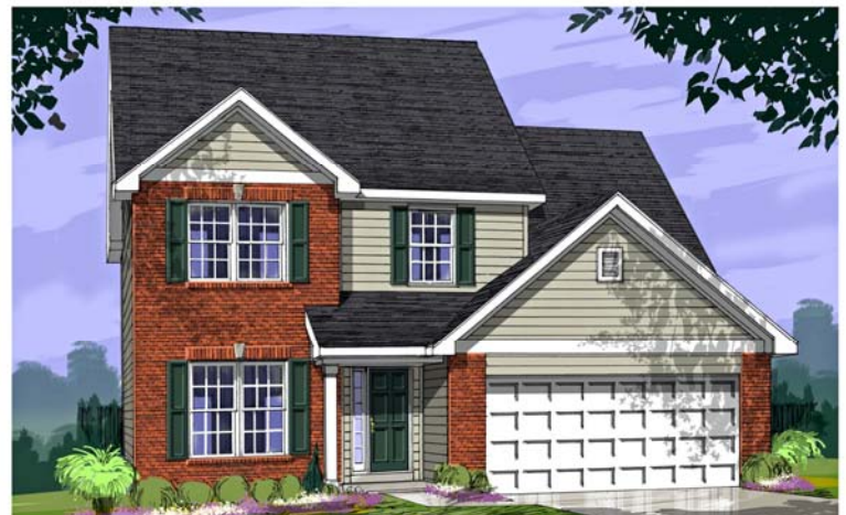
TRADITIONAL ELEVATION A