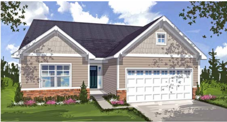
CRAFTSMAN ELEVATION D