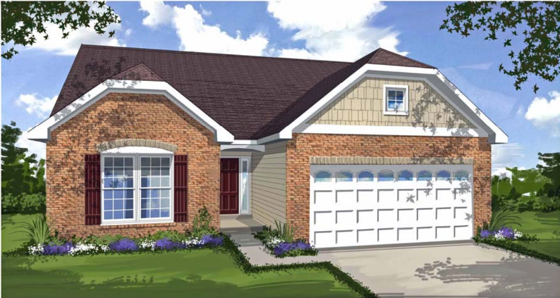
OLD WORLD ELEVATION C