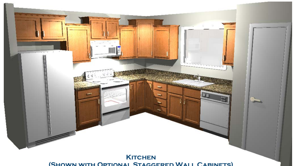
KITCHEN (SHOWN WITH OPTIONAL STAGGERED WALL CABINETS)