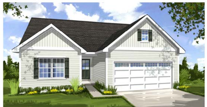
COTTAGE ELEVATION B