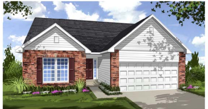
TRADITIONAL ELEVATION A