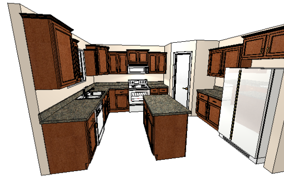
KITCHEN (SHOWN WITH OPTIONAL STAGGERED WALL CABINETS & ISLAND)