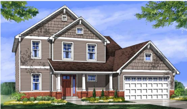
CRAFTSMAN ELEVATION D