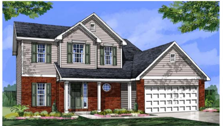
TRADITIONAL ELEVATION A