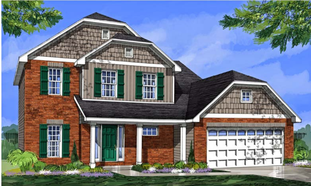
OLD WORLD ELEVATION C