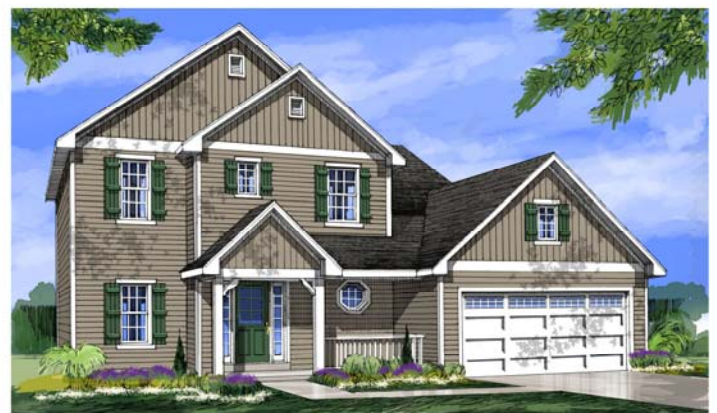
COTTAGE ELEVATION B