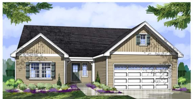
COTTAGE ELEVATION B