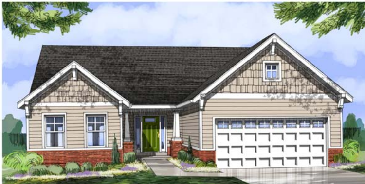
CRAFTSMAN ELEVATION D