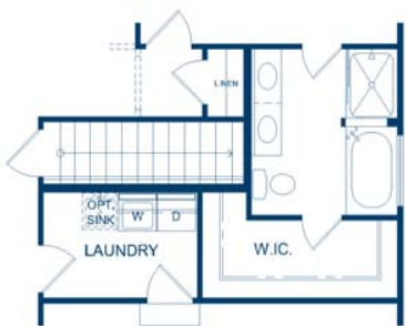
LUXURY MASTER BATH