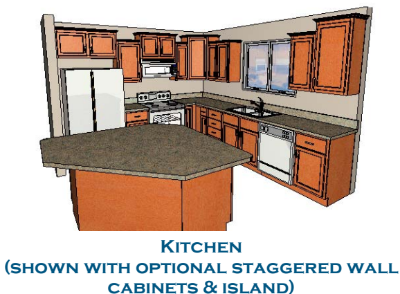
KITCHEN (SHOWN WITH OPTIONAL STAGGERED WALL CABINETS & ISLAND)