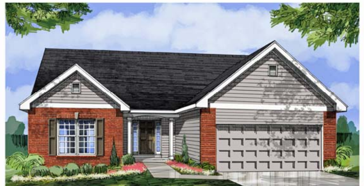
TRADITIONAL ELEVATION A