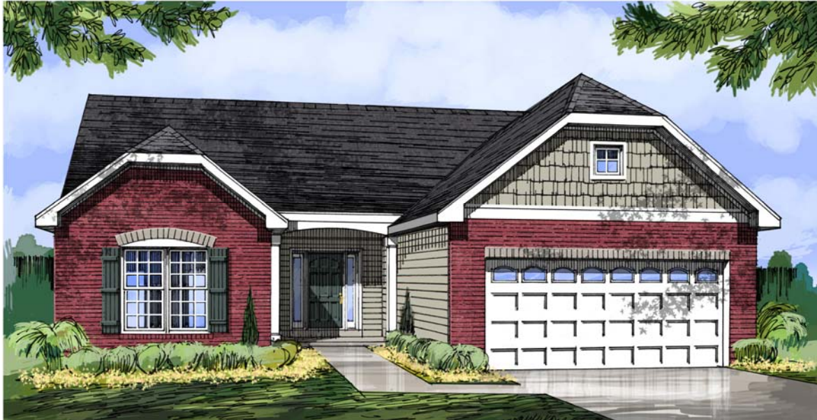
OLD WORLD ELEVATION C