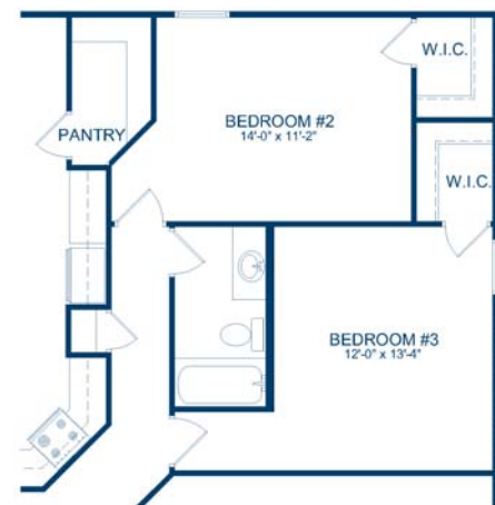
OPTIONAL HALL BATH