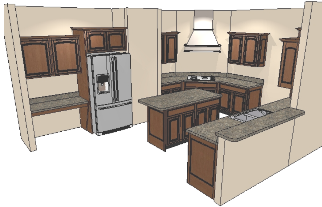
KITCHEN (SHOWN WITH OPTIONAL DECORATIVE END PANELS)