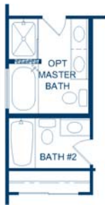
LUXURY MASTER BATH