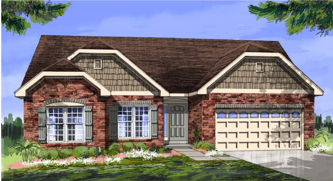
OLD WORLD ELEVATION C