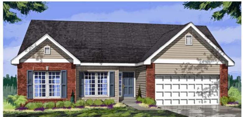
TRADITIONAL ELEVATION A