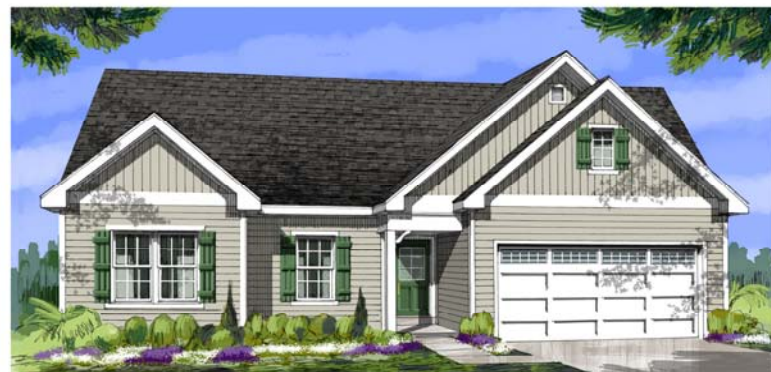
COTTAGE ELEVATION B