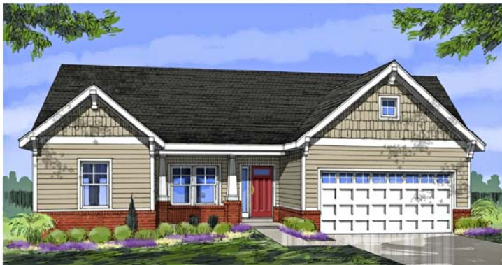
CRAFTSMAN ELEVATION D