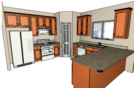
KITCHEN (SHOWN WITH OPTIONAL 42" WALL CABINETS & PENINSULA)